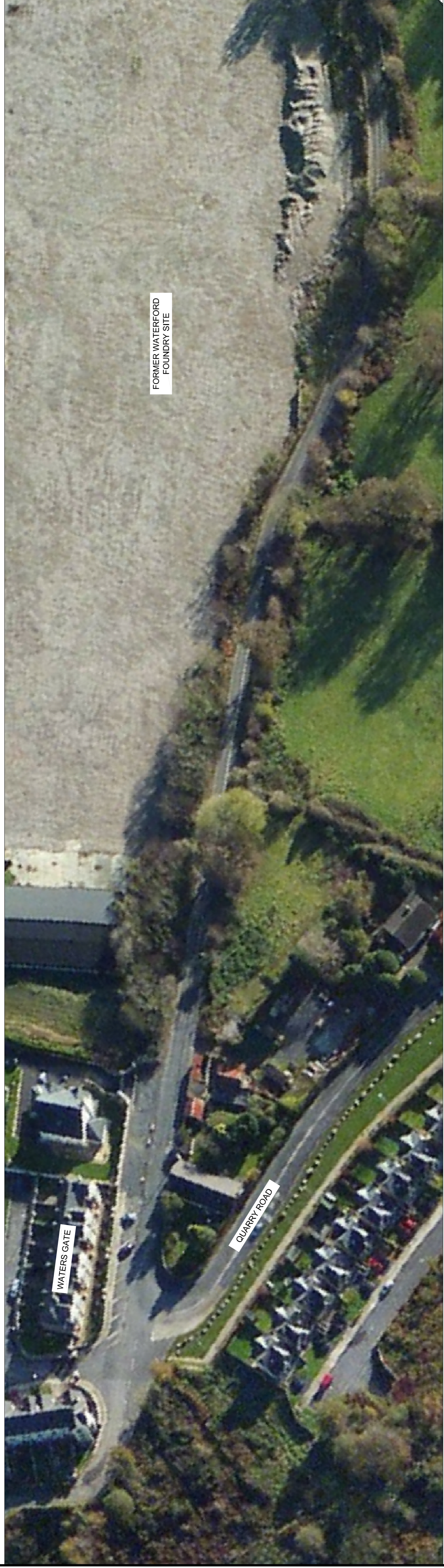
FORMER WATERFORD FOUNDRY SITE